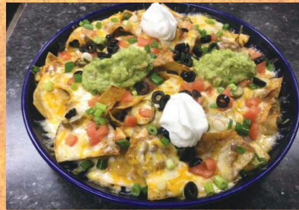
Super Nachos Garcia

Crispy corn tortillas, chicken, fresh avocado and Jack cheese in a homemade chicken broth.